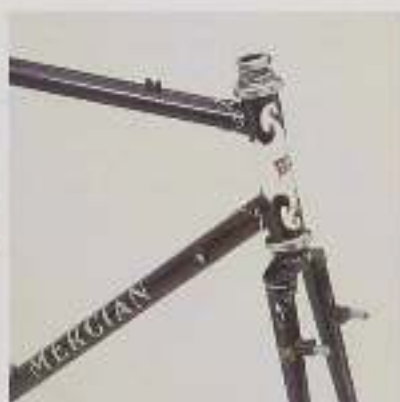
Vincitore head lugs