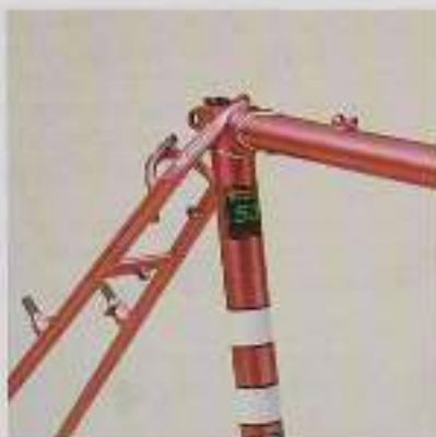
Mercian engraved seat stays on King of Mercia