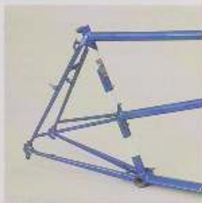
Rear ends on Super Tourist Model