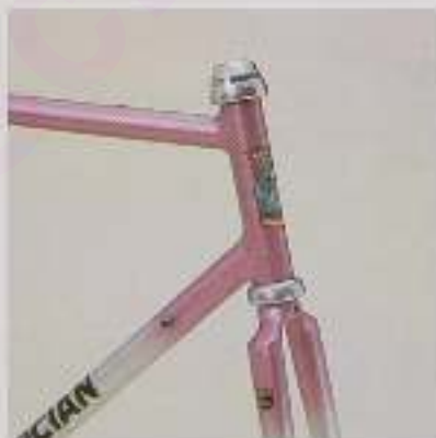
Pro lugless head with Cinelli Aero Crown

Any single colour of your choice with Merzino transfers