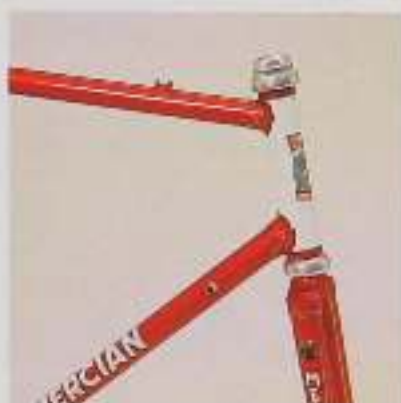
Hand cut Superlight lugs