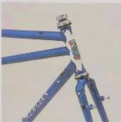
Hand cut Lugs on Merzender Tandems

Any colour of your choice with contrasting head and triple seat tube band, lugs lined and Merzender transfers.