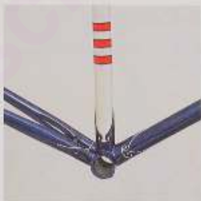
Long fancy spearpoints on Vincitore Special

Specification and brazings as our Strada Speciale Model.