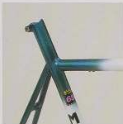
Fastback seat stays on Low Profile