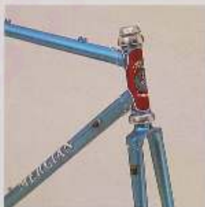
Clover leaf cutouts on the Strada Speciale

Reynolds '653' tubing is available at extra cost – see frame price list.