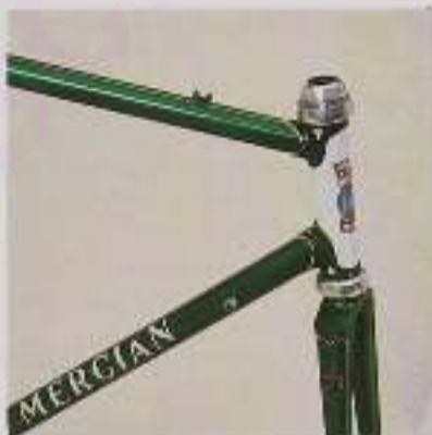
Heart cutout lugs and Romani crown on King of Mercia

Reynolds '653' tubing is available at extra cost - see frame price list.